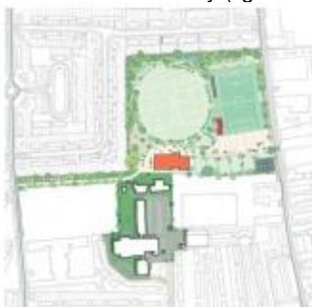
01: Sports and Park