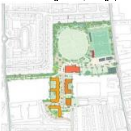
02: Demolition and Residential

Final iteration with new Sports Hall (dark red) in BLPF