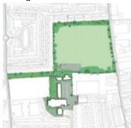
00: The Existing Site